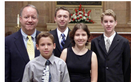
Four of our scholarship recipients pose with a Chapter member at a recital in 2005.